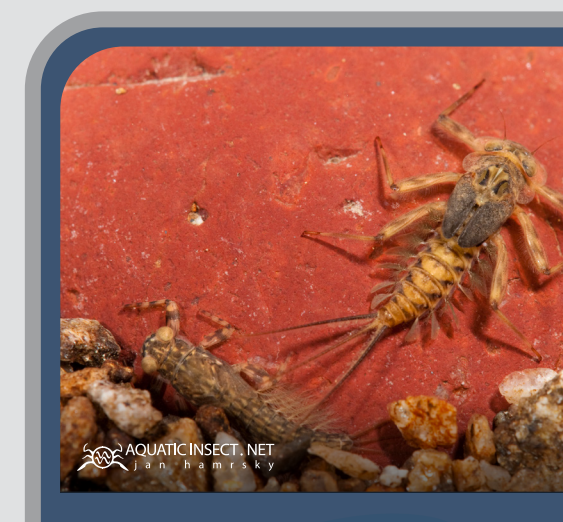
Cold water can hold more dissolved oxygen than warm water. Levels lower than 5 parts per million (mg/L) are stressful to cold water species, like this juvenile mayfly.

is the concentration of oxygen molecules dissolved in the water (not the air bubbles). Fish and aquatic insects use their gills to absorb this form of oxygen underwater.