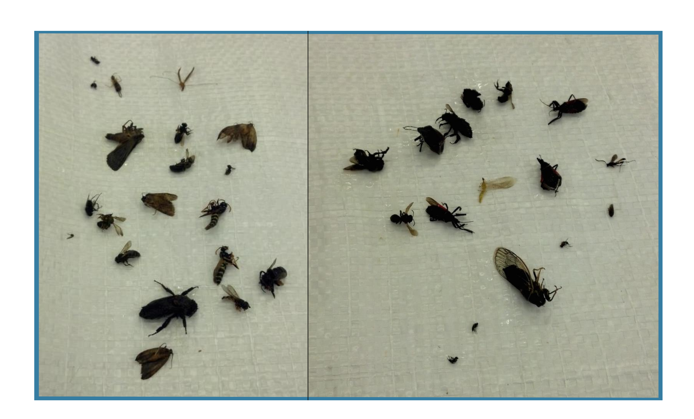
Image 3: (Left) Ground level NHMU combination trap sample. (Right) NHMU green roof combination trap sample.

Pollinators appear to be more prevalent in our NHMU roof sample compared to ground level.