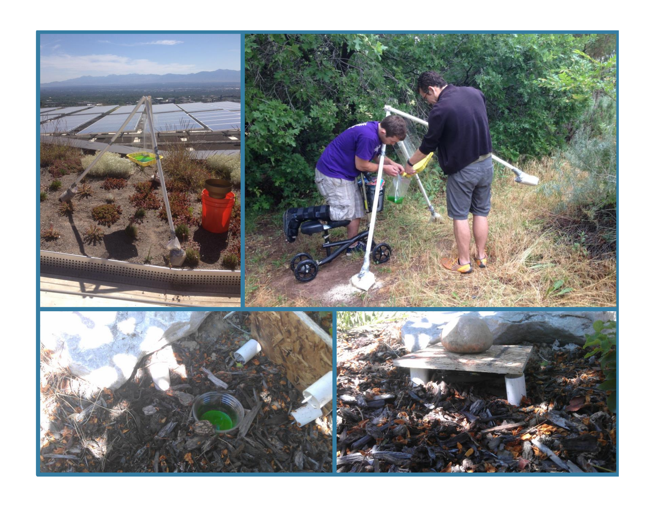
Image 2: (Top Left) Combination trap on the roof of the Natural History Museum of Utah. (Top Right) NHMU Ground level Trap. (Bottom Left, Right) Pitfall Trap.

Site Selection: extensive green roof (NHMU), intensive green roof (Marriott Library), and nearby ground-level landscaped areas for comparison.