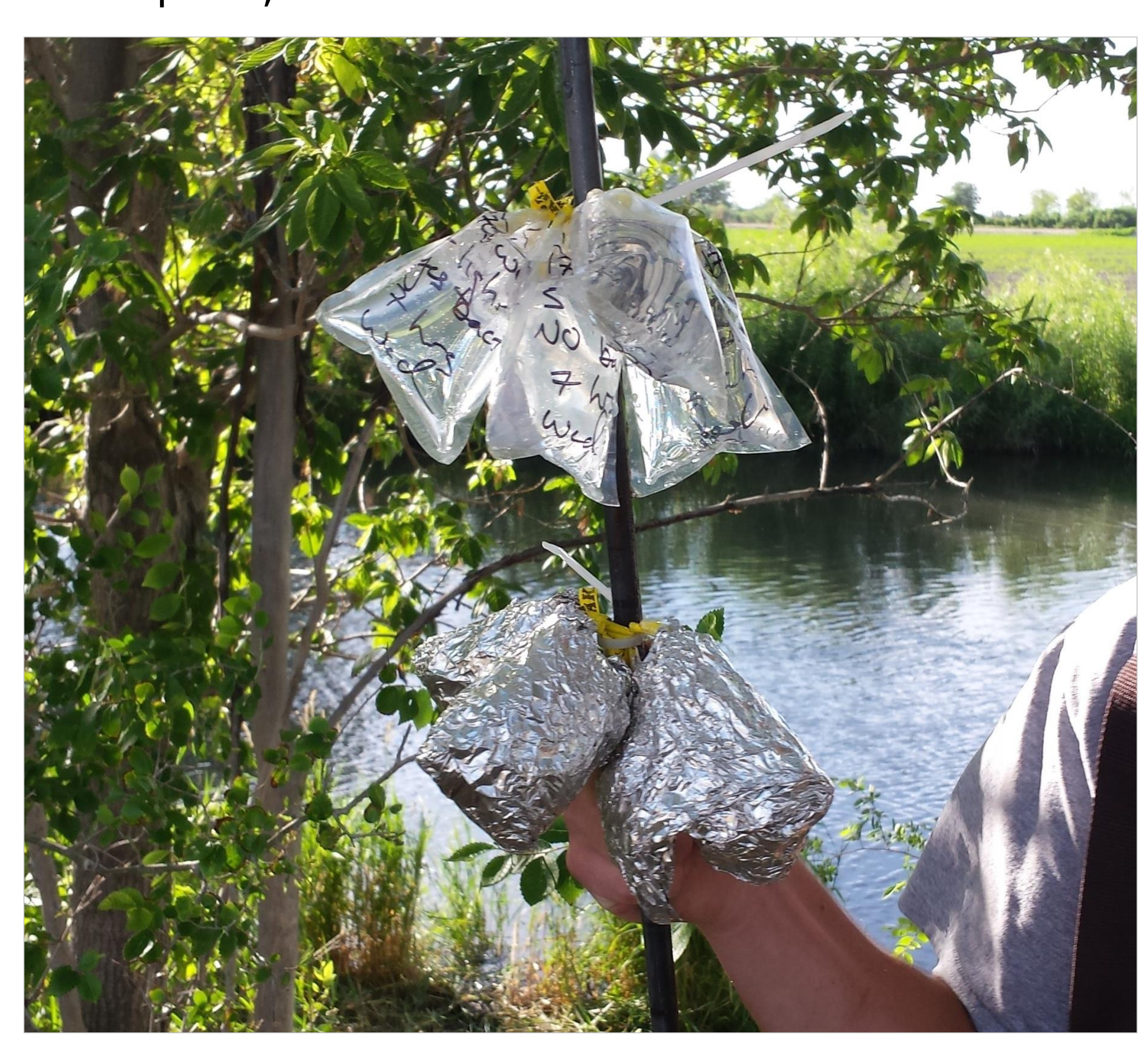
Figure 2. Sample treatments to be incubated in the Jordan River