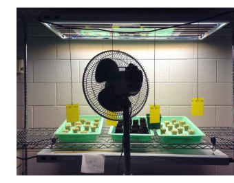
Figure 1: The kale and pepper starts indoors, under a shock.

For this experiment we set up three growing environments: indoors with grow lights, in a greenhouse, and outdoors on a roof. In each environment, we had triplicate plant samples – 3 kale plants in hydroponic systems, 3 pepper plants in hydroponic systems, and 3 pepper plants in soil.